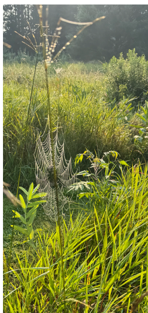
Spider Web on Big Blue Stem Grass Early Morning 8/1/25

Today's Nature Notes celebrate insects and arachnids. Each offers curious beauty. Their unique specialization has evolved with purpose within the ecology of Northwestern Wisconsin; specifically our Gillespie Creek neighborhood