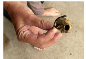
Who Spent Winter 2025 In This Stillwater, MN House?

Today's Nature Notes celebrate the wonders of Nature June 2025 from America's Southwest corridor to the Midwest.