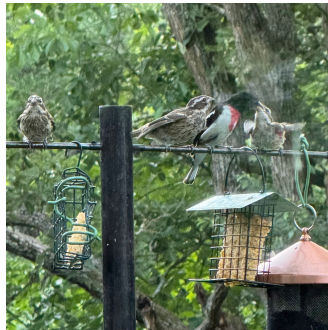
Male Rose Breasted Grosbeak Feeding His Fledglings. Where Is Mom? 6/28/25 Gillespie Creek, WI

Little snail, Dreaming you go, Weather and rose Is all you know. Weather and rose Is all you see, Drinking The dewdrop's Mystery