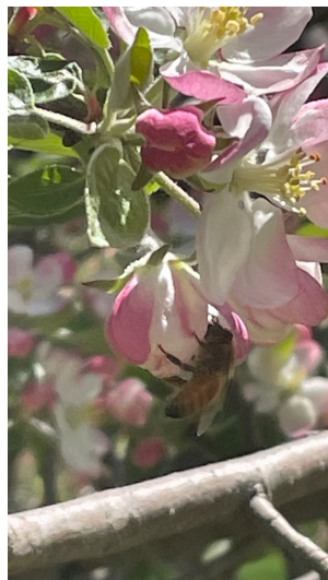
Honey Bee Visiting Apple Blossoms in Minnesota 5/4/24

This week I have chosen to share a poem and photos sent to me by followers. Each is an ephemerals experience.. Enjoy!