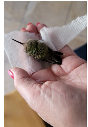
Hummingbird Baby Rescued From a Birdbath

Nature's Treasurers Abound