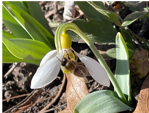
March 16, 2024 Worker Bee Gathering Pollen on a Snowdrop Flower Rural Stillwater, Mn

The study of cyclic and seasonal natural phenomena, especially in relation to climate and plant and animal life.