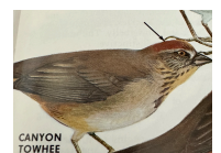
Towhee Photos by Western Birds of North America Peterson Guide