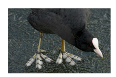
Coot Feet Amazingly Unique by "Alama"

Interestingly I've also read that a Coot breast filleted, fried in oil with salt and pepper is pretty tasty!