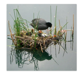
Coot Family