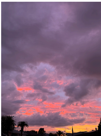
Sun City Sunset 11/16/23