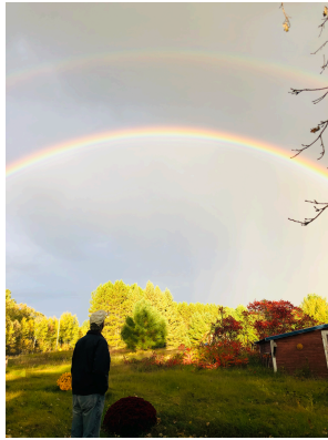
La Follette Township Wisconsin Double Rainbow 9/28/20