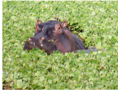
"Lettuce Pond" Bathing Hippo in Kenya East Africa 4/14/18