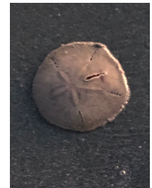
Isle of Palms Sand Dollar 11/29/2021

A bird came to me On the open wind. He was alive and singing. Flight was behind him, But it was not his story. There is a gift, he said. It is sweet and round. It covers much ground. Its embrace is always Present. I had a craving For more. I had a desire For glory. He looked into My eyes, and then at The yard around us. Here is your prize, He said. Each moment Has warmth and depth. The secret to being wise? Be in it.