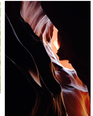
Antelope Canyon Page, Arizona 5/15/18