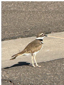
Killdeer Standing in Am Lutheran Parking Lot 11/12/23 Sun City, Arizona