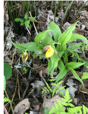
Ladyslipper 6/4/22 Gillespie Creek, Wisconsin

Rogers and Hammerstein gave us the glorious song “June is Bustn’ Out All Over” in 1945 when their collaborative musical “Carousel,” based on Ferenc Molnar’s 1947 story of love, conflict, betrayal and forgiveness became an international hit.