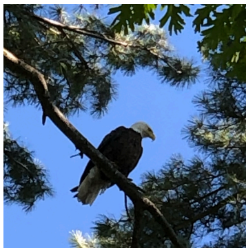
Eagle 6/2/21 Straight Lake State Park

As with all things in life, one must be prepared for conflict; pesky insects are bust'n out all over in the month of June