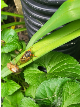
Chicago Area Cicada Emerging from Its Chrysalis 5/29/23