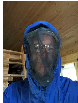
A Northern Wisconsin Gardener Ready to do Battle With Mosquitos 6/1/ 2023