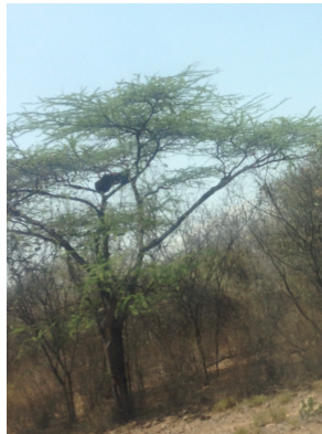
Bedroll in a Kenyan Acacia Tree?

Farmers in Kenya, East Africa are known to nurture bees, hand harvest and process Acacia Honey. The "bedroll" in my photo is actually a hollowed out log prepared and hung from the branches of the Acacia, Black Locust tree. Acacia honey is low in sucrose and high in the flavonoids and phenolic chemicals that provide natural antioxidants to the human body.