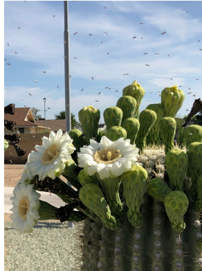
Saguaro Cactus Top in Bloom May 18, 2023