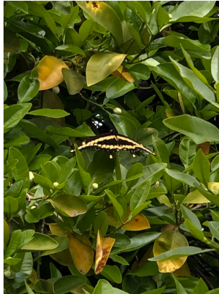
Giant Swallowtail Butterfly Sun City, Arizona 3/20/23