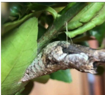
Giant Swallowtail Chrysalis