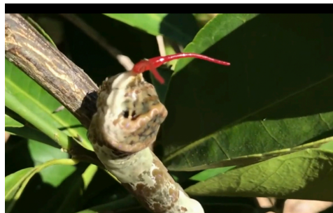
Giant Swallowtail Caterpillar