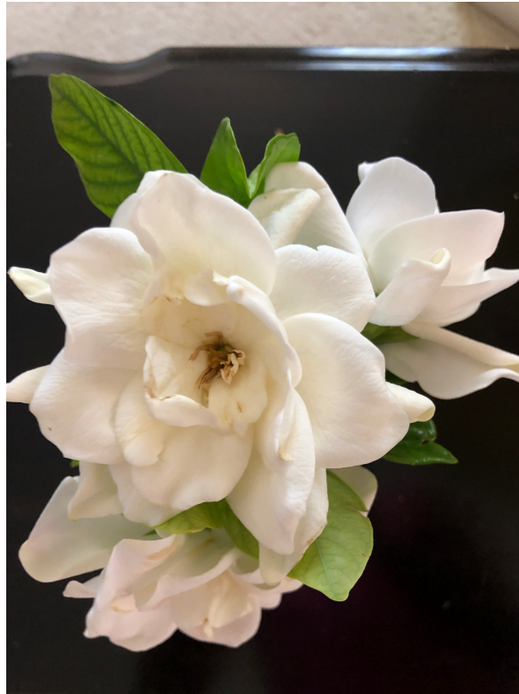
Sun City Garden Gardenia May 2023

Google research further states that the Gardenia belongs to the "Rubiaceae" family, also known as the coffee or madder family. There are approximately 140 identified species of Gardenias.