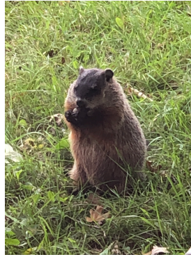
Gillespie Creek "Chucky"