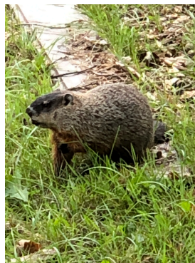
Chucky Lives in Our Woodshed Until the Garden Romain Lettuce and Broccoli are Prime. He Then Moves into the Raised Bed Where Meals are more Convenient