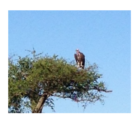
African Crowned Eagle

Can crickets predict temperature? (Count the number of times a cricket chirps in 14 seconds and add 40 to that number. Is the total the temperature current in Fahrenheit?)