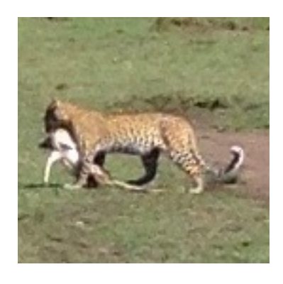
Then to Mom Leopard Retrieving the Gazelle and Delivering it to Her Waiting Cub

This Eagle brought us to the dead Gazelle stored in the tree photo on the left.