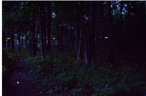
Fireflies at Night

Research tells me that the light of the firefly is a chemical reaction caused by an organic compound- luciferin. As air rushes into a firefly's abdomen, it reacts with the luciferin. This causes a chemical reaction that gives off the firefly's glow (cold light.). 2000 different Firefly species exist.